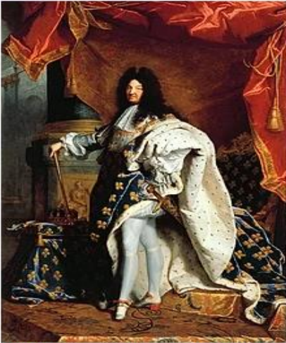
Portrait de Louis XIV en costume de sacre (par Hyacinthe Rigaud, 1701).