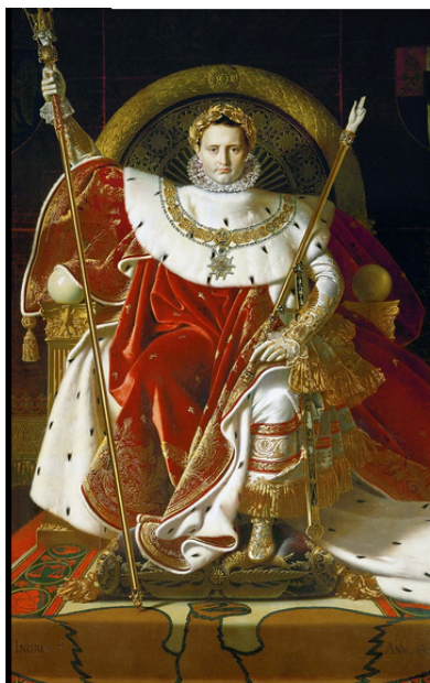
Napoléon 1 er sur le trône impérial Jean-Auguste-Dominique Ingres Huile sur toile 1806 Musée de l'Armée, Paris