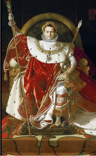
Napoléon 1 er sur le trône impérial Jean-Auguste-Dominique Ingres Huile sur toile 1806 Musée de l'Armée, Paris

Title of the document : Portrait of Napoleon the 1st (= Napoleon Bonaparte)